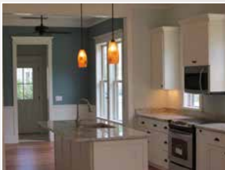
The Coosaw River model is for sale at $363,231 and is open daily for tour.