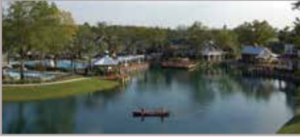
East West Communities' Eagle Landing Residents' Club in Jacksonville, FL.