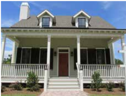
The Coosaw River model is for sale at $363,231 and is open daily for tour.

Coastal Living magazine has selected Beaufort, SC as the "Happiest Seaside Town In America." The Well Being Index, sunny days, healthiness of beaches, crime ratings, walkability, standard of living and financial well being of the locals, and "coastal vibe" were part of the voting criteria.