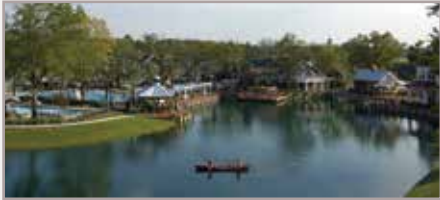
East West Communities' Eagle Landing Residents' Club in Jacksonville, FL.